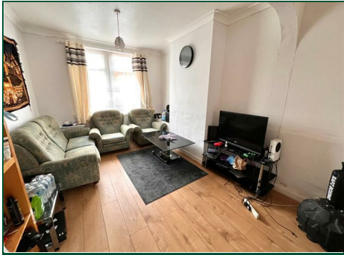
GROUND FLOOR 412 sq.ft. (38.3 sq.m.) approx.